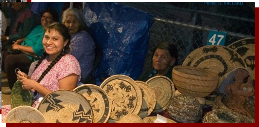
Basket makers show their wares.