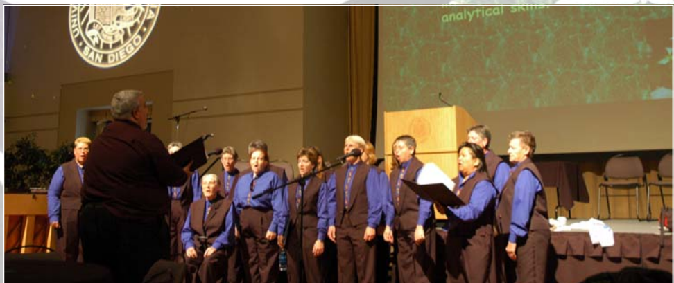
San Diego Women's Chorus